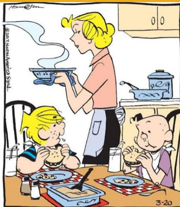
“MY MOM IS SUCH A GOOD COOK, SHE COULD WORK AT A FAST-FOOD PLACE.”

Would you like to receive this newsletter at home ?