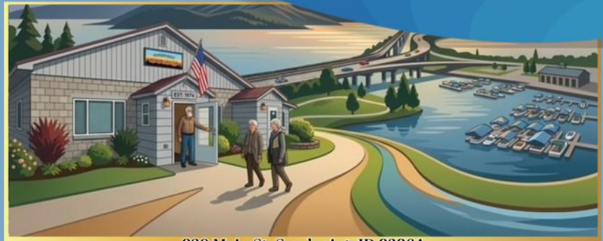
820 Main St. Sandpoint, ID 83864