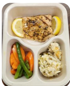
Salmon HDM Hot Tray