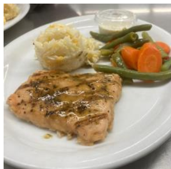
Salmon Dine In Lunch.

Another month has flown by! Thanks so much for all of your feedback. I am trying to get all your menu requests on the menu and if you don't see it then they will be in a following month. I sure appreciate the guests in the dining room and all the great compliments. I must add that our great team and all our volunteers and kitchen assistants are the true heroes that make all the magic happen. We are adding some more fruits and vegetables to our trays and salad bar. This is the dawn of spring and we are hoping to add the freshie fresh to our cuisine. More fresh salads and fruit salads. Any salad recipe suggestions will be appreciated. Hope ya'll have a great spring!