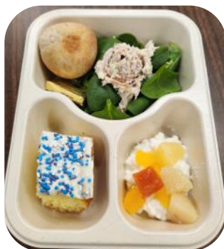
Salad HDM Cold Tray