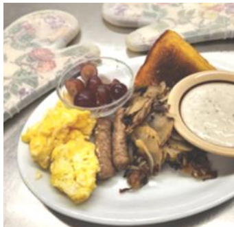
Scrambled Eggs, Sausage, Potatoes Breakfast