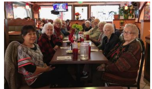
The SPORT Train ride was great fun! Dinner after was yummy!!

Alzheimer's Association 800-272-3900 www.alz.org www.alzwa.org