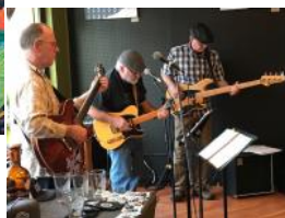
Thank you, musicians!

Support Groups for Families, Caregivers and Friends of those with Dementia, Alzheimer's and memory challenges