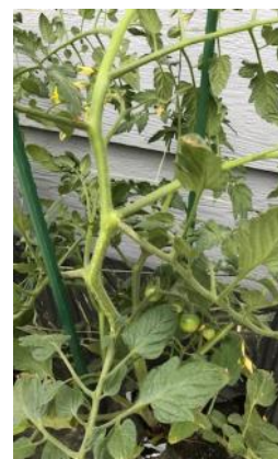
We have tomatoes!! More on p.6.

On Saturday, June 17 and July 8 from 1:00-4:00 pm, you may bring over items you would like to donate for the sale. For large items please call the office to arrange a time for drop-off at the Center.