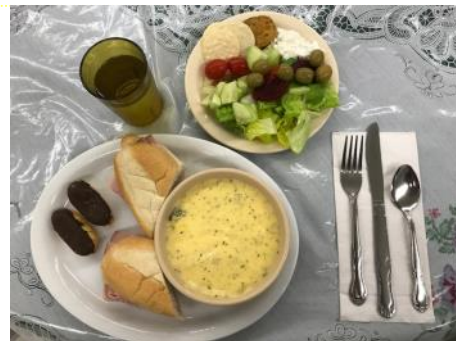
We eat well at SASi!