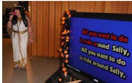
Kostume Karaoke was a huge hit!

Mountain West Bank's Ponderay Branch staff held a Bake Sale and customers and staff rallied and raised $500 for SASi! Thank you all!!