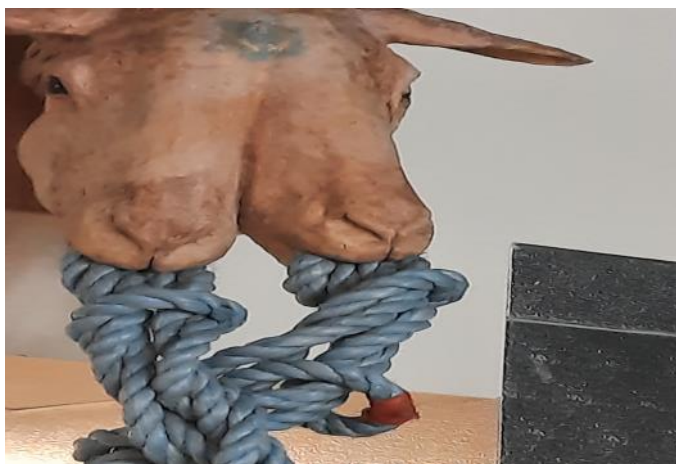
The Breakfast Cantina in Ponderay

Thank you generous supporters!! Find names and logos from donor organizations at www.sandpointareaseniors.org/community-support/