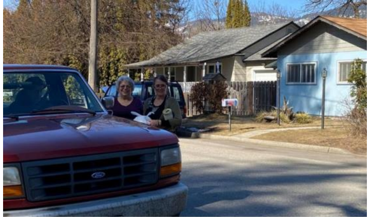
Delivering a "Grab and Go" meal to a client. Pictured here are SASi Employees.